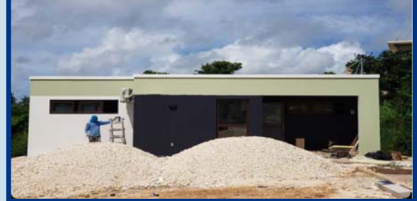
Typhoon Reinforced Design Under Review

A Program Manager and Finance Manager have been recently hired, a dedicated office has been secured, top infrastructure projects lists were transmitted to the Governor in September 2019, for his review and approval, requisite data mining series of meetings with key State stakeholders have begun and are ongoing, data sharing Memorandums of Understanding have been transmitted to US FEMA and US SBA required for grant planning. Working drafts of the action plan and corresponding policies and procedures have begun. As of September 30, 2019, NMHC so far has expended $100,145 for the ongoing preparation.