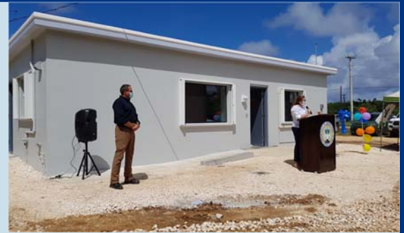
FEMA New Construction

Aside from the Program Manager and Finance Manager, the Project Manager, Compliance Manager and Administrative Manager have been recently hired. Other support staff will be hired starting mid-October. Two additional offices have been secured to house the CDBG-DR program staff and to serve the community. As of September 30, 2020, NMHC so far has expended $460,971 for the ongoing preparation.