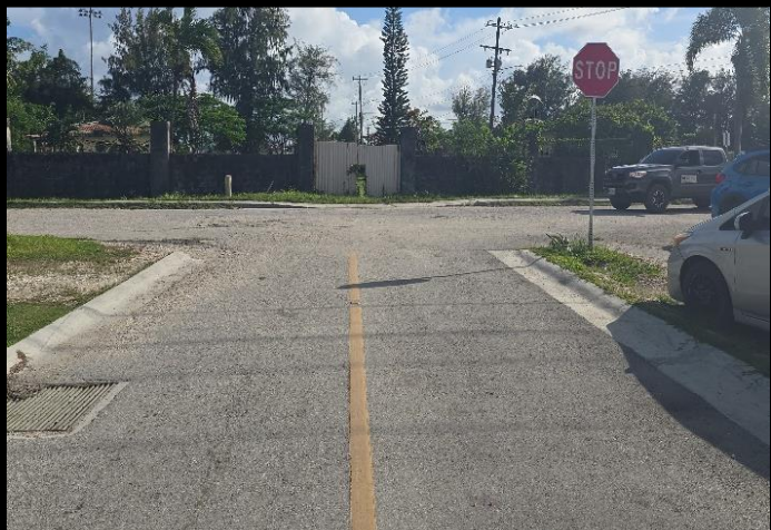
NEW ASPHALT ROADWAY WITH DRAINAGE AT THE BACK OF BEST DEAL MERCHANDIZE ALONG APENGAGH STREET (GOING SOUTH).

The completion of the “Apengagh Street and Ghilis Road Drainage Improvement Project” provides a drainage system to gather rainwater traveling in the new concrete curb and gutter. The rainwater will be collected through the catch basin going to the oil-water separator. The oil-water separator contained 3 chambers to separate the oil, water and other materials. These chambers were covered with steel manholes to help during the maintenance and removal of other solid wastes found inside each chamber. Next, the rainwater will be strained in the infiltrator chamber to remove other contaminants. With this process, the rainwater will be discharged back to the with clear and clean rainwater.