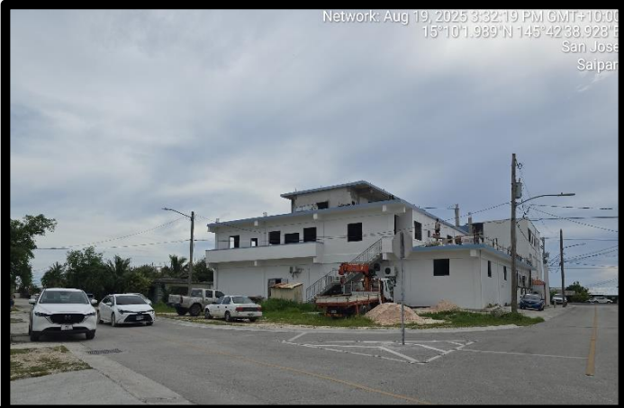
NEW ASPHALT INTERSECTION ROADWAY BETWEEN APENGAGH ST. (GOING SOUTH) CHURCH AND GHILIS ROAD (GOING WEST)