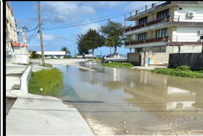
OLD ASPHALT ROADWAY FROM SAN JOSE CHURCH GOING TO NEW DOWNTOWN MARKET ALONG GHILIS ROAD (GOING WEST).