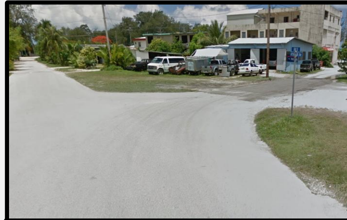
OLD ASPHALT INTERSECTION ROADWAY BETWEEN APENGAGH ST. (GOING SOUTH) CHURCH AND GHILIS ROAD (GOING WEST)