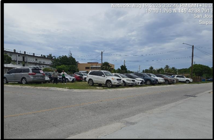
PARKING SPACE IN FRONT OF THE SAN JOSE CHURCH ALONG APENGAGH STREET (GOING NORTH).