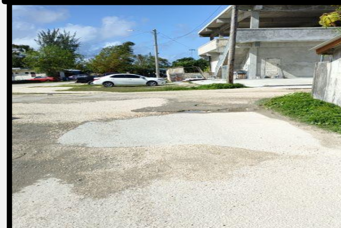
OLD ASPHALT ROADWAY COMING FROM GOLDEN HARVEST INTERNATIONAL SCHOOL AND DAY CARE ALONG WICHIIRA WAY (GOING SOUTH)