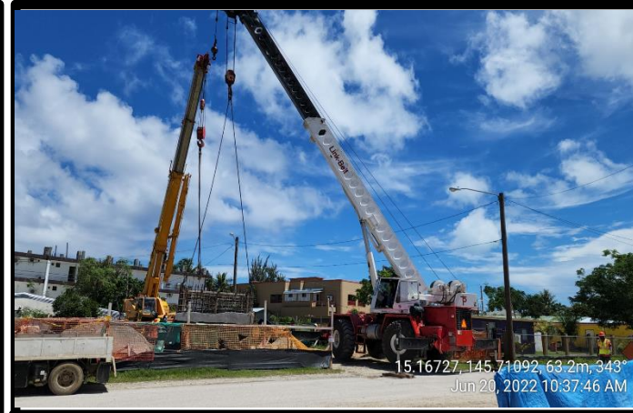
LIFTING OF THE CONCRETE OIL-WATER SEPARATOR.