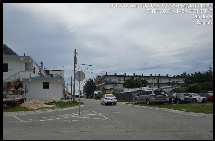
NEW ASPHALT ROAD WITH CURB & DRAINAGE IN FRONT OF SAN JOSE CHURCH GOING TO NEW DOWNTOWN MARKET ALONG GHILIS ROAD (GOING WEST)