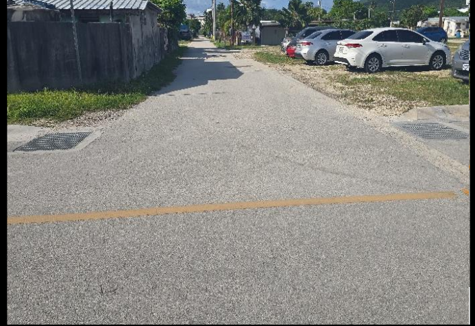
NEW ASPHALT ROADWAY GOING TO GOLDEN HARVEST INTERNATIONAL SCHOOL AND DAY CARE ALONG WISCHIRA WAY (GOING NORTH)