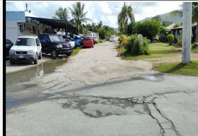
OLD ASPHALT ROADWAY AT THE BACK OF BEST DEAL MERCHANDISE GOING TO SAN JOSE CHURCH ALONG APENGAGH STREET (GOING NORTH)

The “ Apengagh Street and Ghilis Road Drainage Improvement Project ” aims to eliminate the ponding of rainwater on the roadway and deliver the rainfall back to the sea. The rainwater will first collected and then filtered before reaching into the beach front. The original asphalt roadway don’t have a channel to divert the rainwater. This result to the ponding of rainwater on top of the roadway and causes more damages as well. Travelling made it difficult with the drivers as well as the pedestrians walking along these roads. Lastly no traffic signs were installed making it more unsafe on both travelers and drivers.