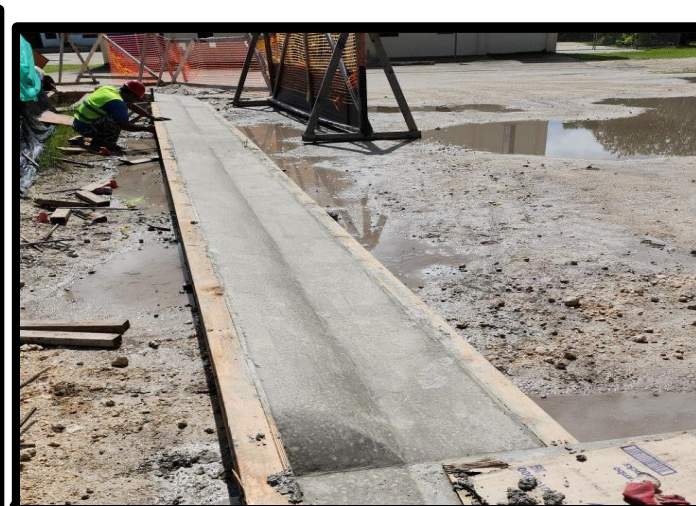
INSTALLATION OF CONCRETE CURB