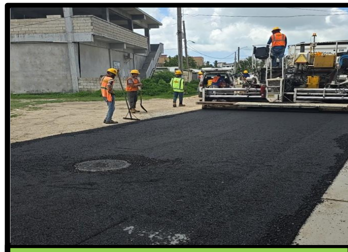
ASPHALTING AND COMPACTION ACTIVITIES ALONG APENGAGH AVENUE

The construction activities in the “Apengagh Street and Ghilis Road Drainage Improvement Project”.