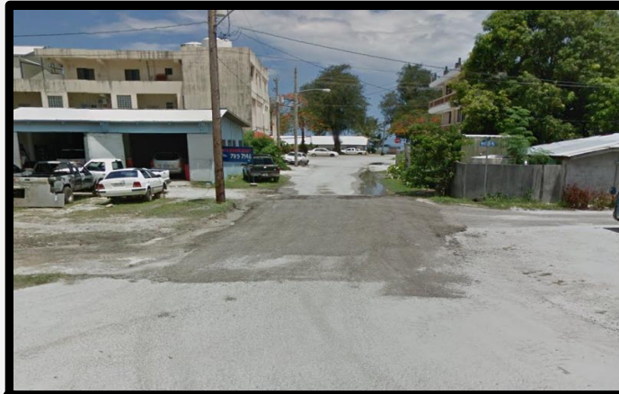
OLD ASPHALT ROAD IN FRONT OF SAN JOSE CHURCH GOING TO NEW DOWNTOWN MARKET ALONG GHILIS ROAD (GOING WEST)