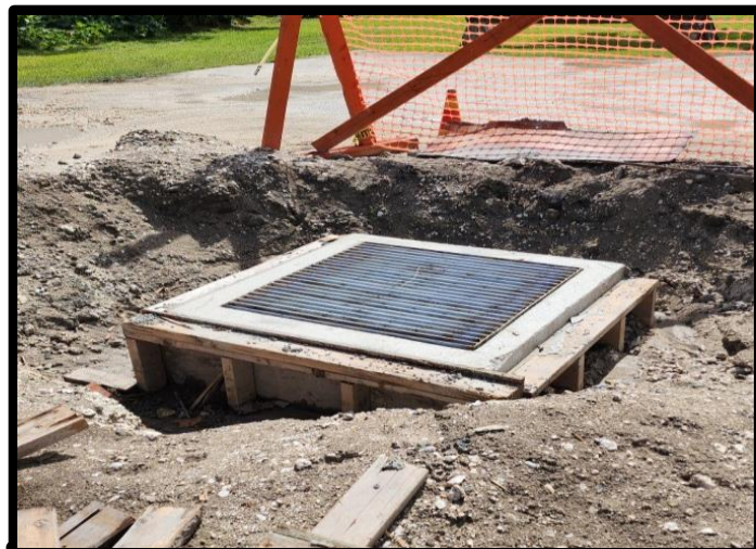
INSTALLATION OF CONCRETE CATCH BASIN