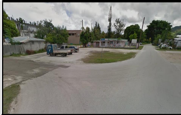
OPEN SPACE IN FRONT OF THE SAN JOSE CHURCH ALONG Ghilis APENGAGH STREET (GOING NORTH)