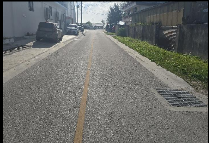
NEW ASPHALT ROADWAY WITH GUTTER AND DRAINAGE GOING TO NEW DOWNTOWN MARKET ALONG GHILIS ROAD (GOING WEST).