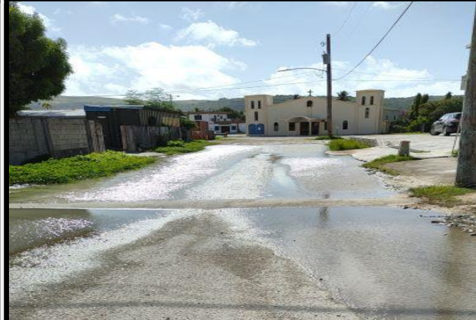
OLD ASPHALT ROADWAY FROM NEW DOWNTOWN MARKET GOING TO SAN JOSE CHURCH GHILIS ROAD (GOING EAST).