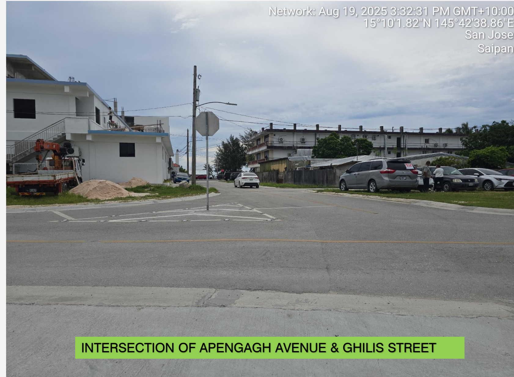
INTERSECTION OF APENGAGH AVENUE & GHILIS STREET

Network: Aug 19, 2025 3:32:31 PM GMT+10:00 15°10'1.82"N 145°42'38.86"E San Jose Saipan