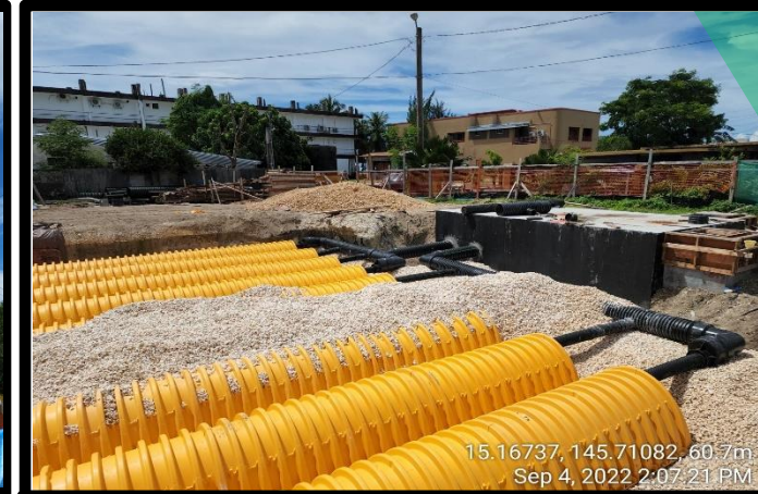
INSTALLATION AND CONNECTION OF THE CONCRETE OIL-WATER SEPARATOR AND INFILTRATOR SYSTEM