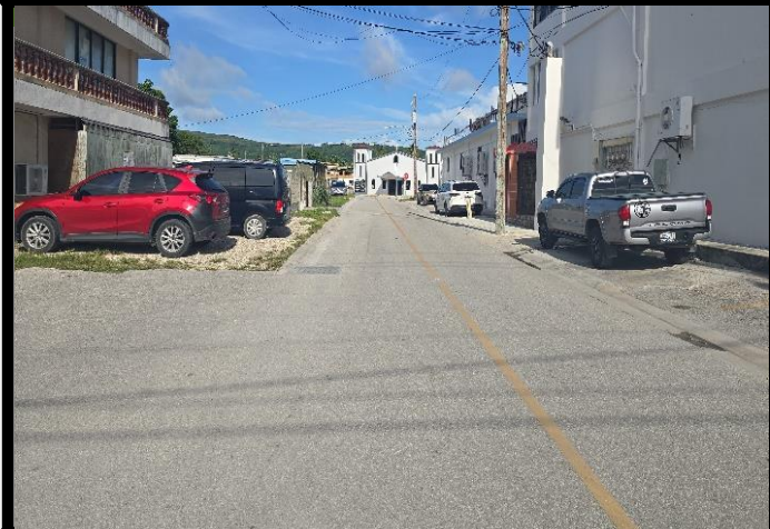
NEW ASPHALT ROADWAY WITH DRAINAGE FROM NEW DOWNTOWN MARKET TO SAN JOSE CHURCH ALONG GHILIS ROAD (GOING EAST).

The completion of the “Apengagh Street and Ghilis Road Drainage Improvement Project” provides a drainage system to gather rainwater traveling in the new concrete curb and gutter. The rainwater will be collected through the catch basin going to the oil-water separator. The oil-water separator contained 3 chambers to separate the oil, water and other materials. These chambers were covered with steel manholes to help during the maintenance and removal of other solid wastes found inside each chamber. Next, the rainwater will be strained in the infiltrator chamber to remove other contaminants. With this process, the rainwater will be discharged back to the with clear and clean rainwater.