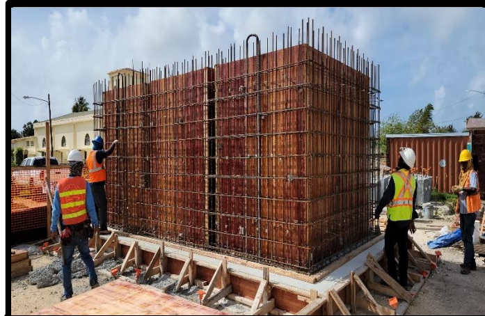
INSTALLATION OF REINFORCEMENT FOR THE OIL-WATER SEPARATOR.