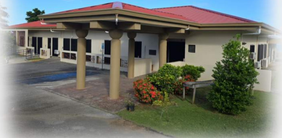
Transitional Living Center