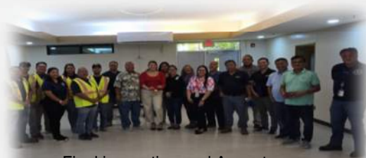
Final inspection and Acceptance