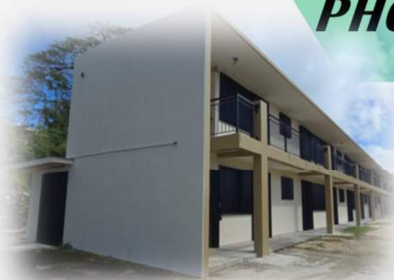
Substance Abuse and Treatment Center Building